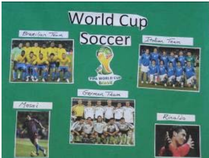
Examples of Charts presented by students (Yr.4-5 level)